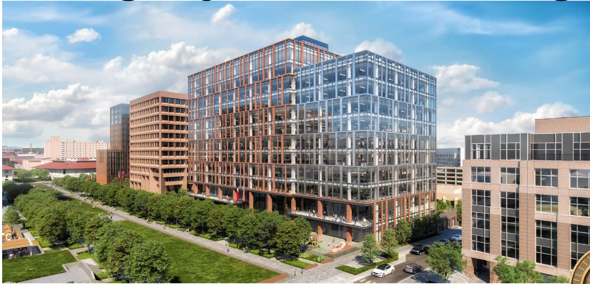
1601 Congress Building