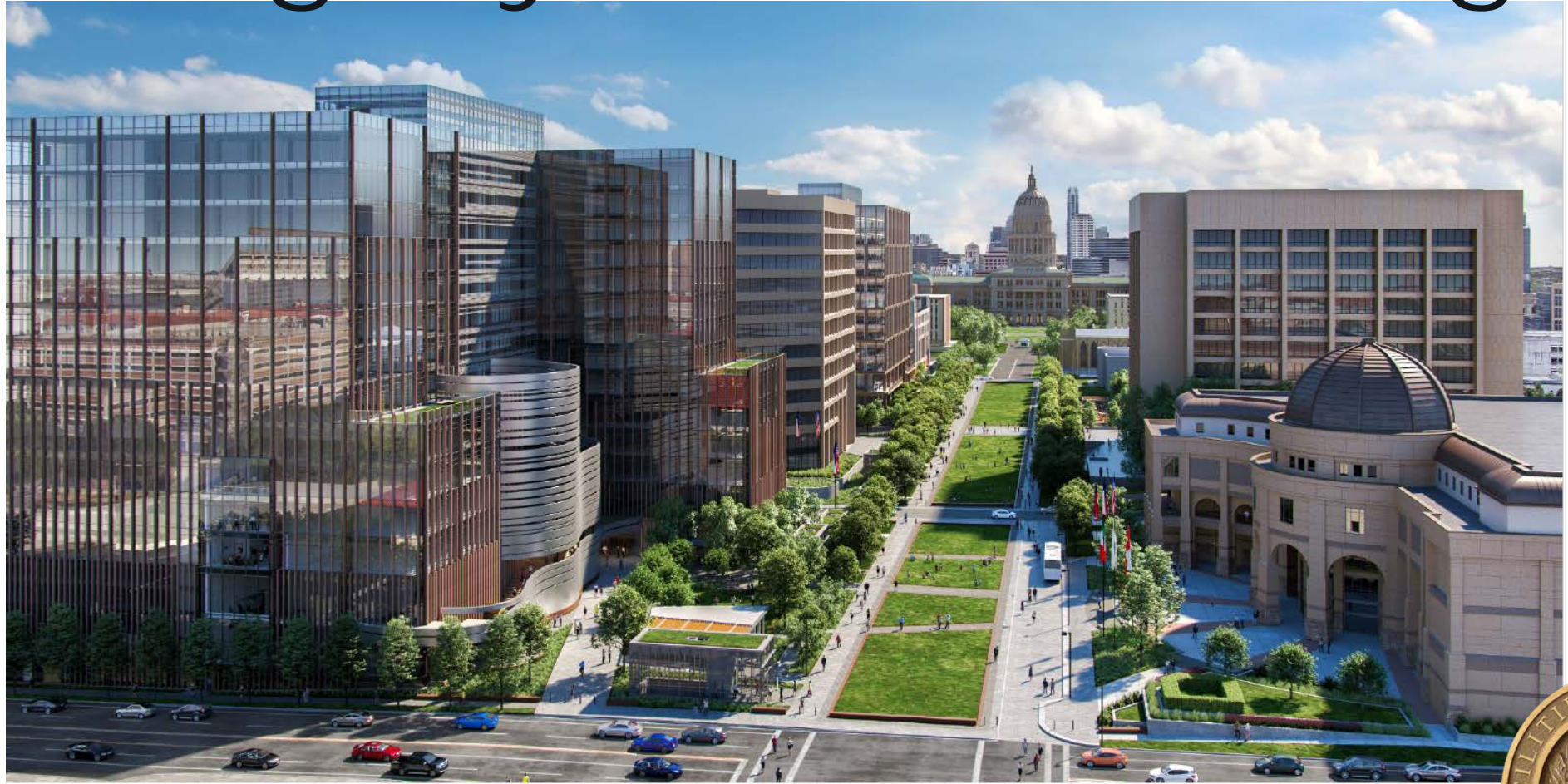
Texas Mall – View from North