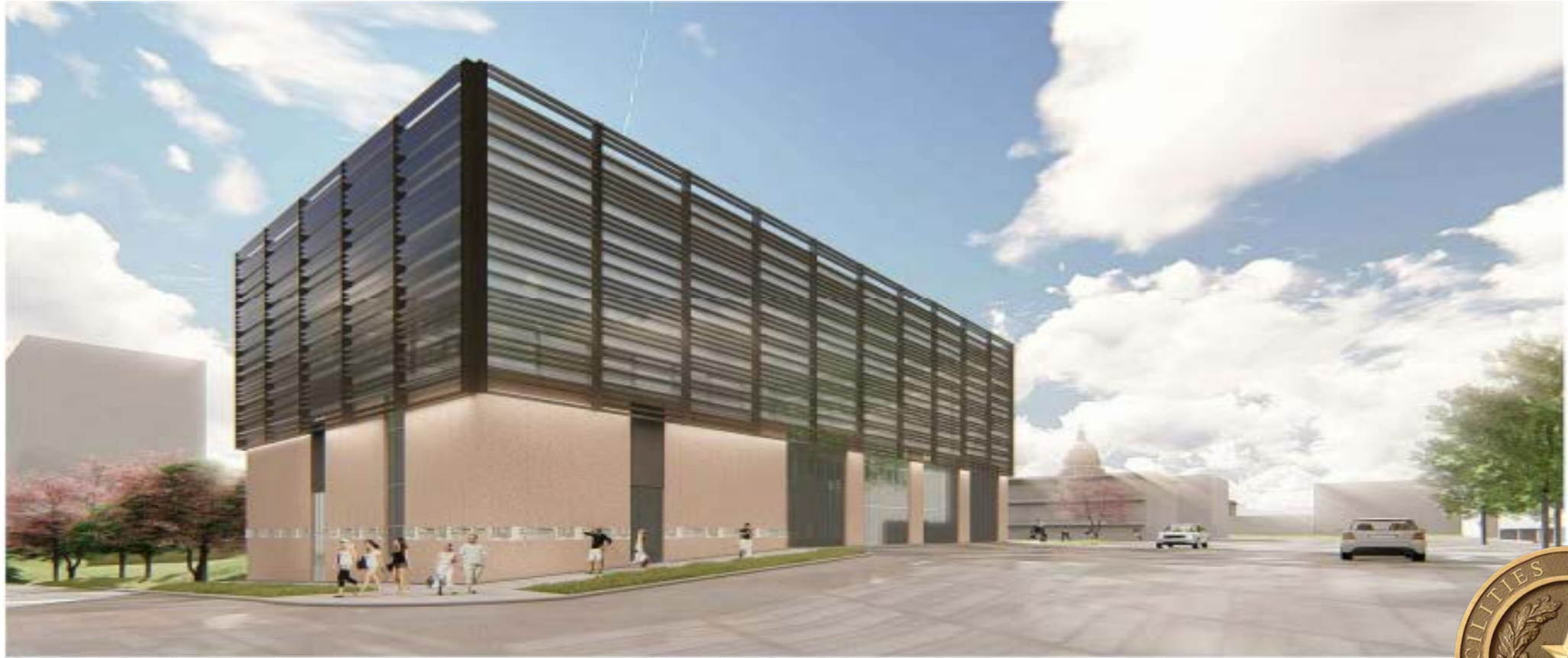
Central Utility Plant