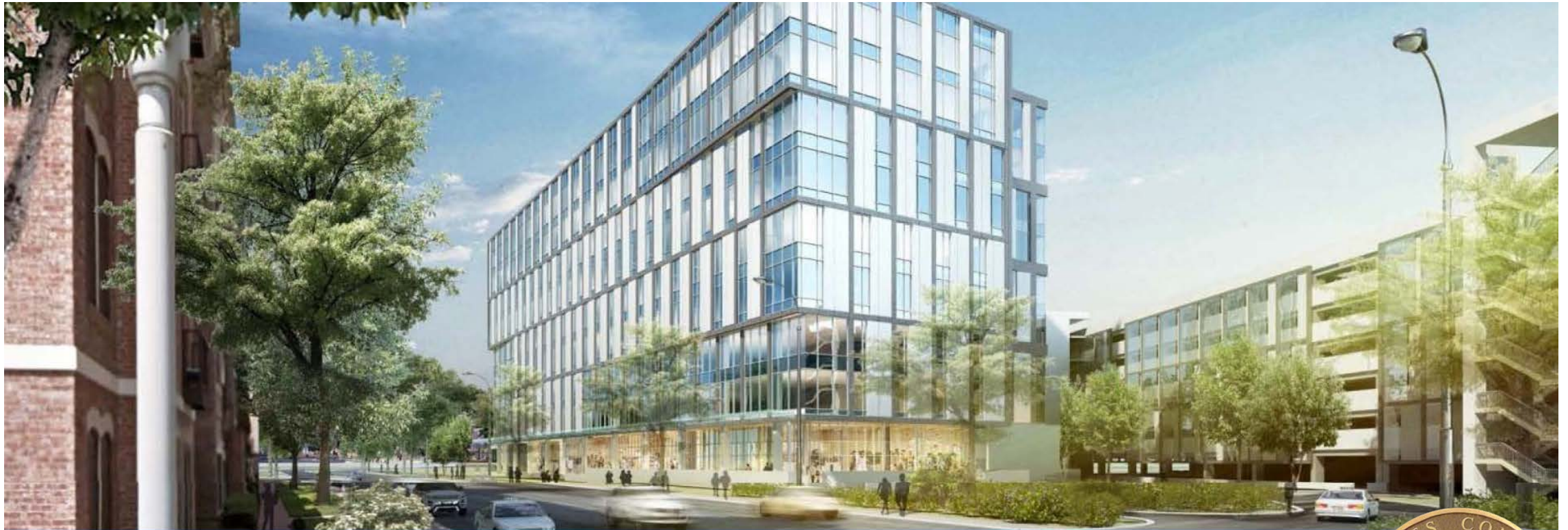
TEXAS FACILITIES COMMISSION NORTH AUSTIN COMPLEX